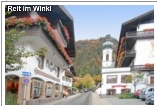
Reit im Winkl