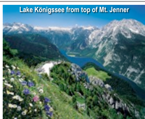
Lake Königssee from top of Mt. Jenner

Today, visit Mt. Jenner for a fun cable car ride with magnificent views. Only the ride up is included. You have the choice of an escorted hike down the mountain with Tom Diez, or you may buy a return cable car ticket on your own and come down at your leisure. Make sure you know when and where to meet Tom at the rendezvous point. Our private coach will return to the hotel at a specific agreed time. Mass (* Traditional Tridentine Rite requested ) follows at the Franziskaner Kirche in Berchtesgaden. Dinner on your own. Remember to give yourself time for packing. * Itinerary subject to change due to weather conditions.