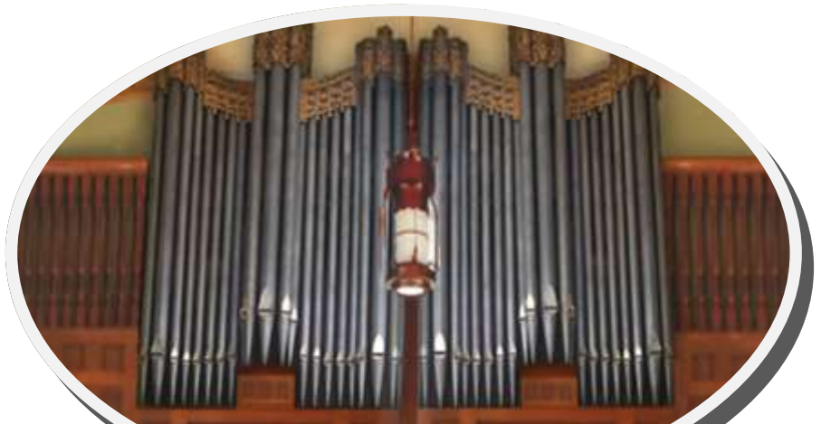
Digital Image of what Casavant's Opus 1130 ("Tina Mae") will look like in August, 2013 .